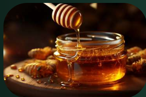
Honey & Other

Connecting Global Markets with India's Finest Harvests