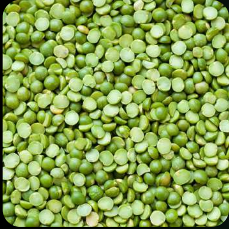
Split Green Peas