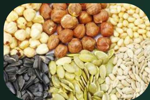
Vegetables Oil & Seeds