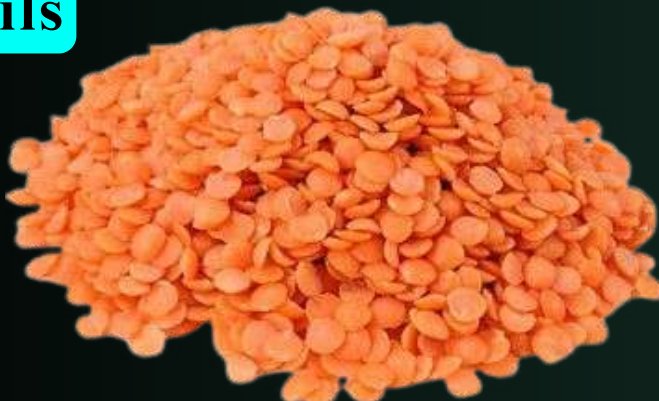
Split Red Lentils