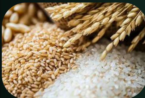
Rice & Wheat