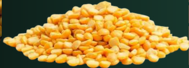
Split Yellow Peas