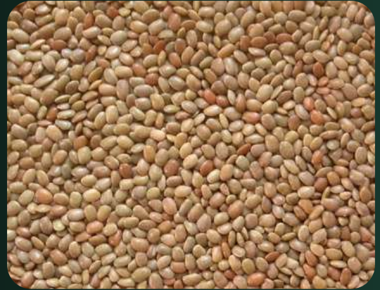
Brown Horse Gram