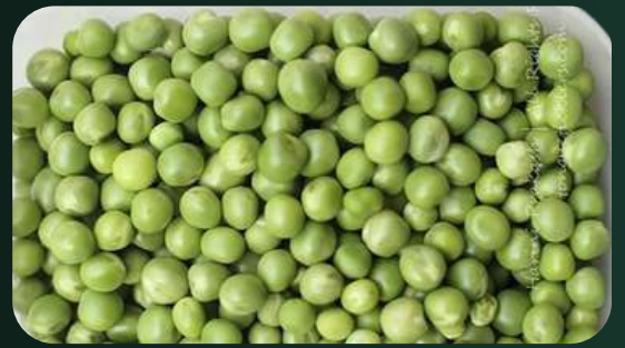
Whole Green Peas