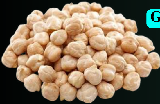
Kabuli Chickpeas (Garbanzo Beans)