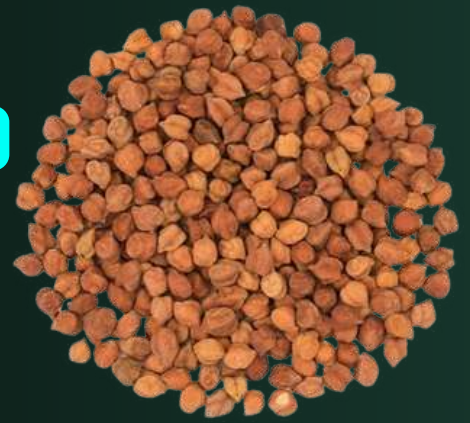
Desi Chickpeas (Bengal Gram)