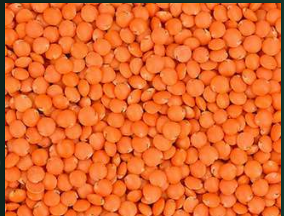
Whole Red Lentils