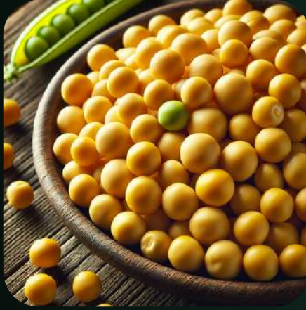
Whole Yellow Peas