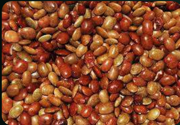
Red Horse Gram